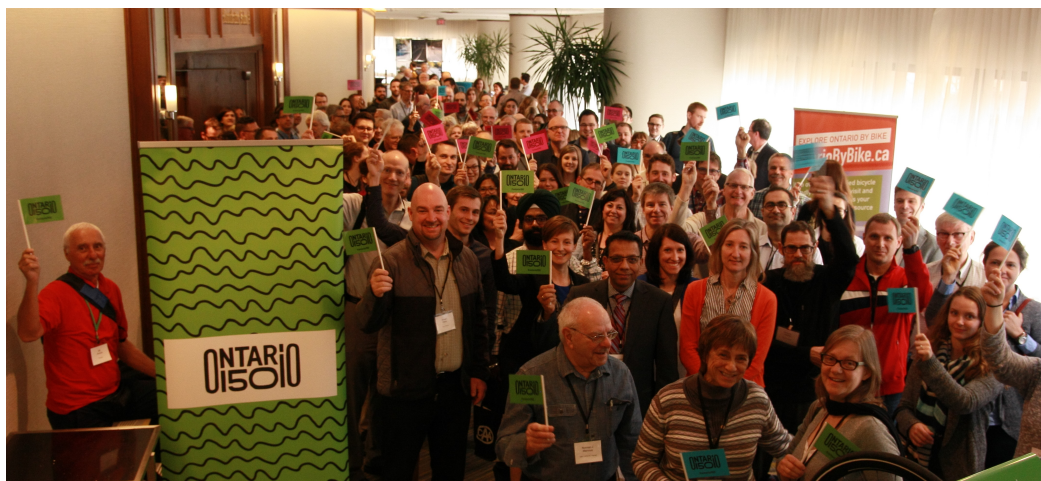
Summit delegates celebrate opportunities to explore Ontario by Bike as part of Ontario150

Minister McMahon also announced support for the development of the Huron North Channel Waterfront Trail, and for Ontario 150: Celebrate by Bike. This sesquicentennial partnership between Share the Road, the Waterfront Regeneration Trust, Ontario by Bike and the Greenbelt Foundation will encourage Ontarians to explore Ontario by bike throughout 2017. This project will develop and share cycling itineraries, support local cycling festivals and provide cycling education opportunities for children and youth.